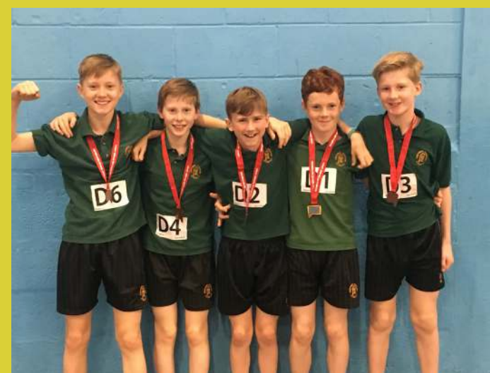
The Year 7 boys athletic team proudly displaying their bronze medals.