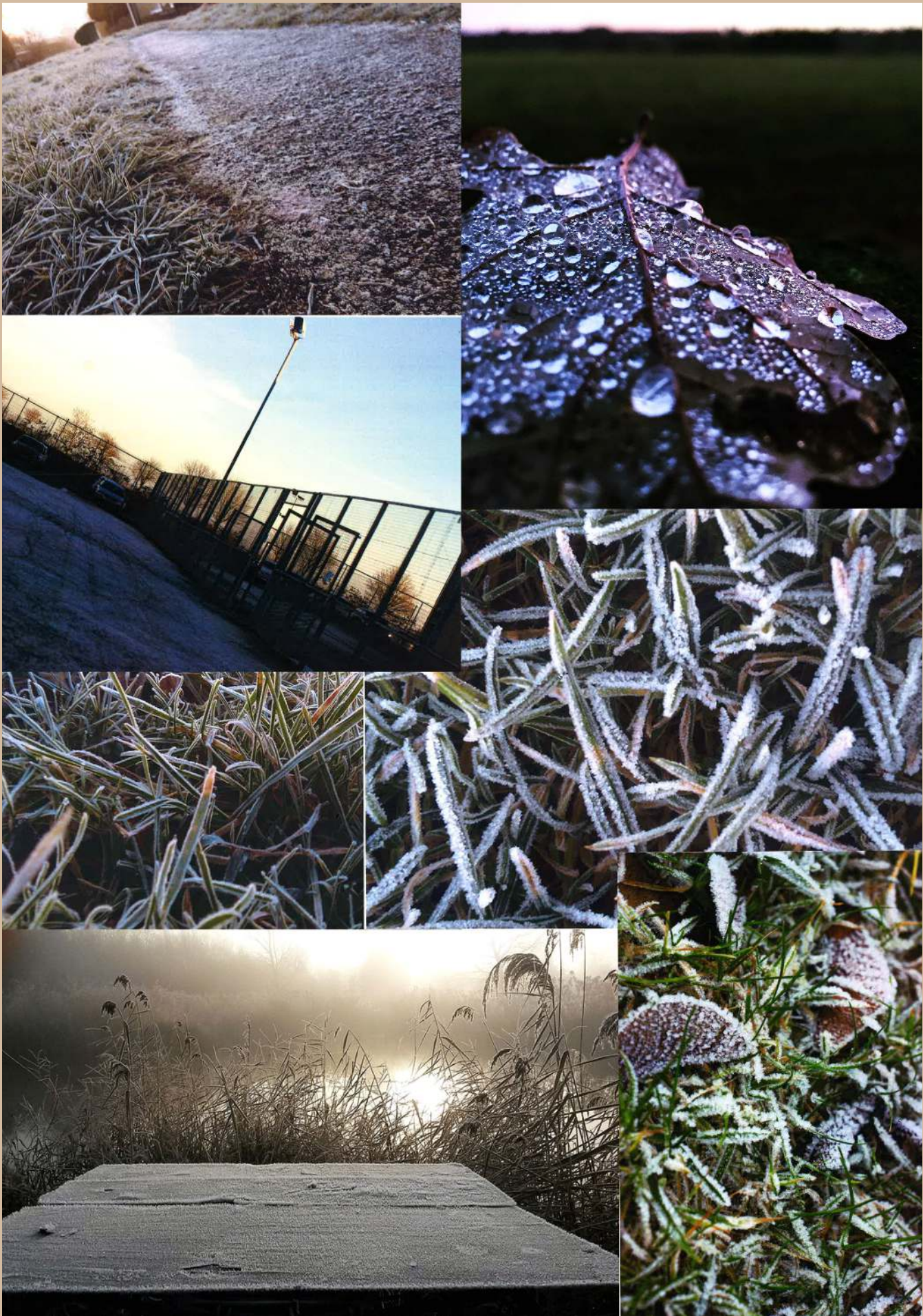
Wonderful photographs from the other entrants to the competition.